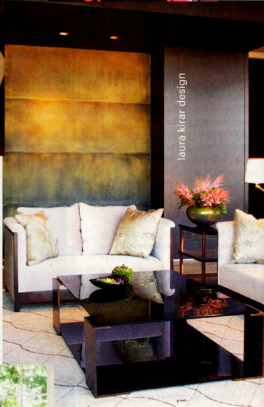
laura kirar design

TRADEMARK / Client-oriented spaces with a contemporary current